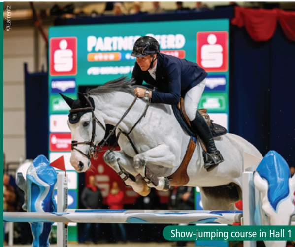
Show-jumping course in Hall 1