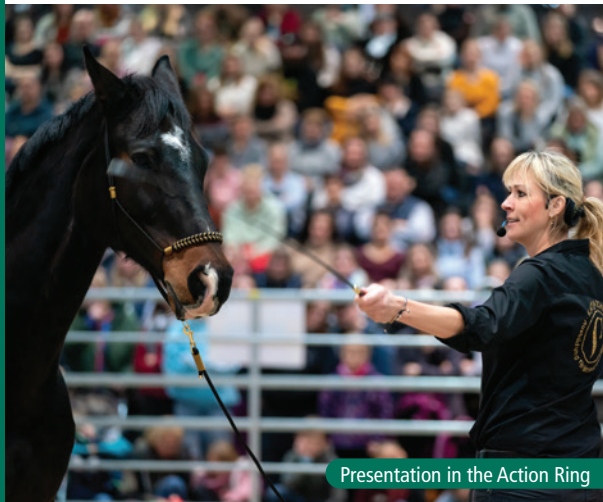
Presentation in the Action Ring