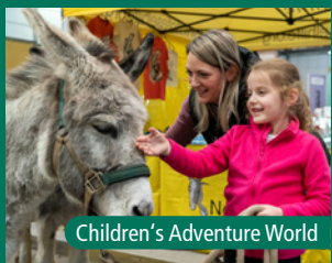
Children's Adventure World