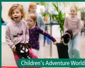
Children's Adventure World