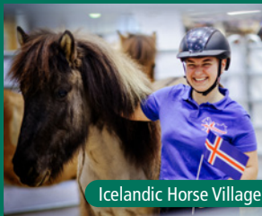
Icelandic Horse Village