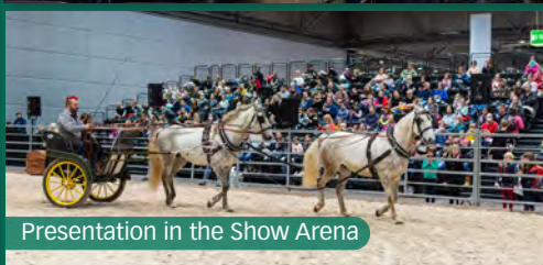
Presentation in the Show Arena