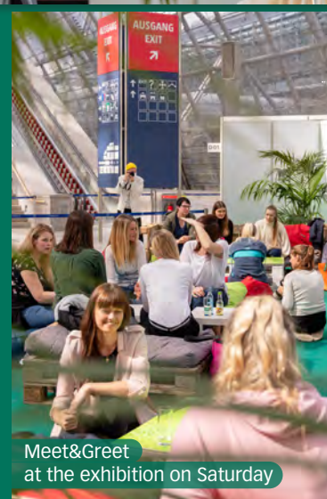
Meet&Greet at the exhibition on Saturday