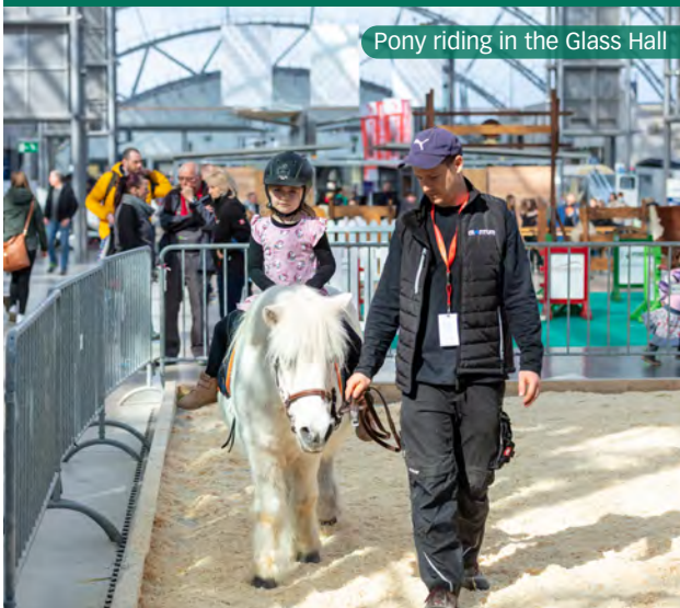
Pony riding in the Glass Hall