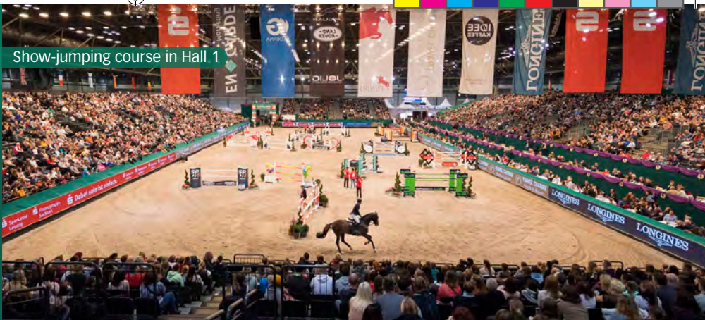
Show-jumping course in Hall 1